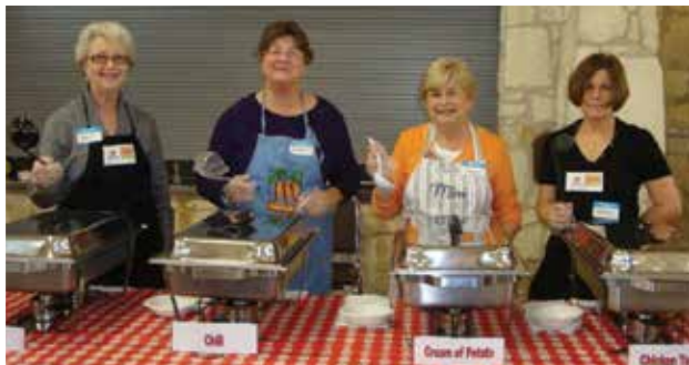
Serving soup with a smile for 24 years.