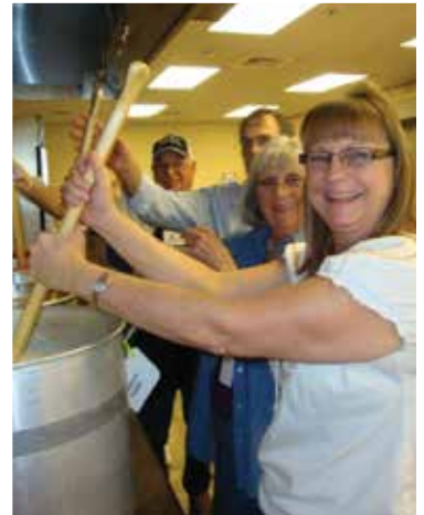
Volunteers stirred the soup with love.

A festive “thank you” to the community for all the support it provides to assist those in crisis in Georgetown and Northern Williamson County with basic human needs, The Caring Place 24th Annual Soup Supper, was held on February 20th. It was a fun evening of food and fellowship. This year’s event featured live music from Swingtime Big Band, and was sponsored by J. Paul Aubin Real Estate Company.